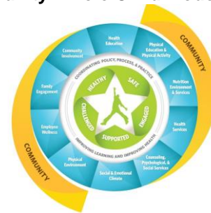
Figure 2. Whole School Whole Community Whole Child Model

All 10 of these components work in tandem to create a collaborative approach to health and learning. The components act as building blocks, with health education being a vital component within the larger model. Defining the essential components of health education raises awareness for the critical policies and practices that guide school districts and schools in addressing students' health and education needs.